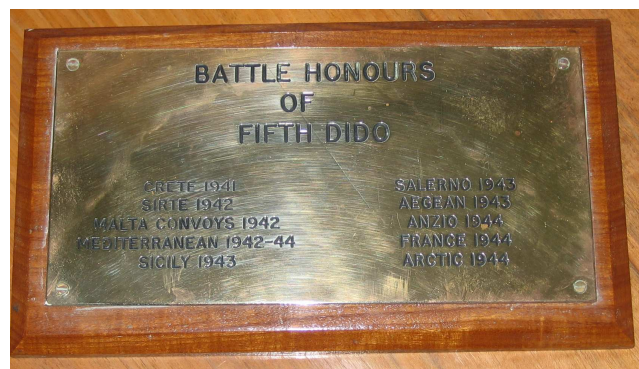
Battle Honours plate from the Cruiser

While we were there we presented a large photograph of the last HMS Dido to the Mayor of Bolton, this is now framed and currently hangs outside the DIDO cafeteria in Bolton Town Hall