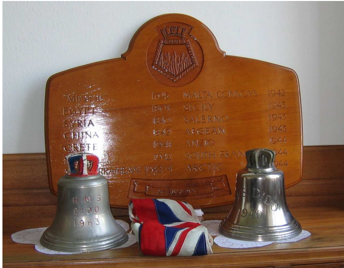
Bells from both Frigate and Cruiser, along with the Battle Honours board from the Captains flat aboard the Frigate, and a mast head ensign

On one of our frequent visits to Bolton we were invited to view some “Dido arte-facts” that had been found in Lutterhalls museum warehouse. These were transported by security and placed on display for us to view in the Mayors Parlour.